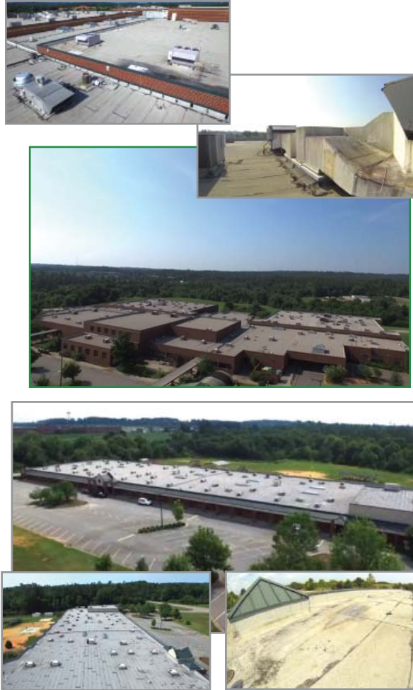
Roof & HVAC Replacements